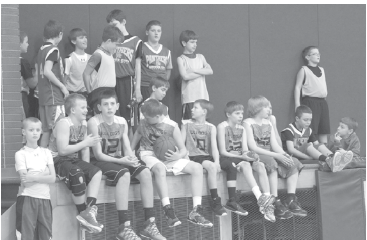
Elementary basketball tournaments - Are not just about competition. During a break in action at the elementary tournament in Craig, MO, on Saturday, Jan. 10, players from Mound City and Fairfax get together to visit and watch other teams play a game.