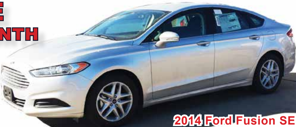
2014 Ford Fusion SE

2 Year Lease 10,500 Miles Per Year $2,500 Cash Down or Trade Equity Payment Based Off Of Richardson County Sales Tax Rates