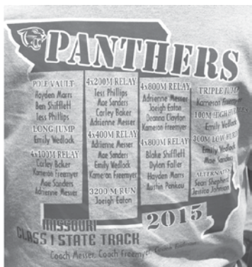
The Mound City R-2 Panthers' track team - Donned "State Bound" t-shirts for the trip to Jefferson City, MO, on Thursday, May 21. On Friday and Saturday, May 22-23, the state qualified members of the team competed for the gold with other Class 1 qualifiers throughout the state.