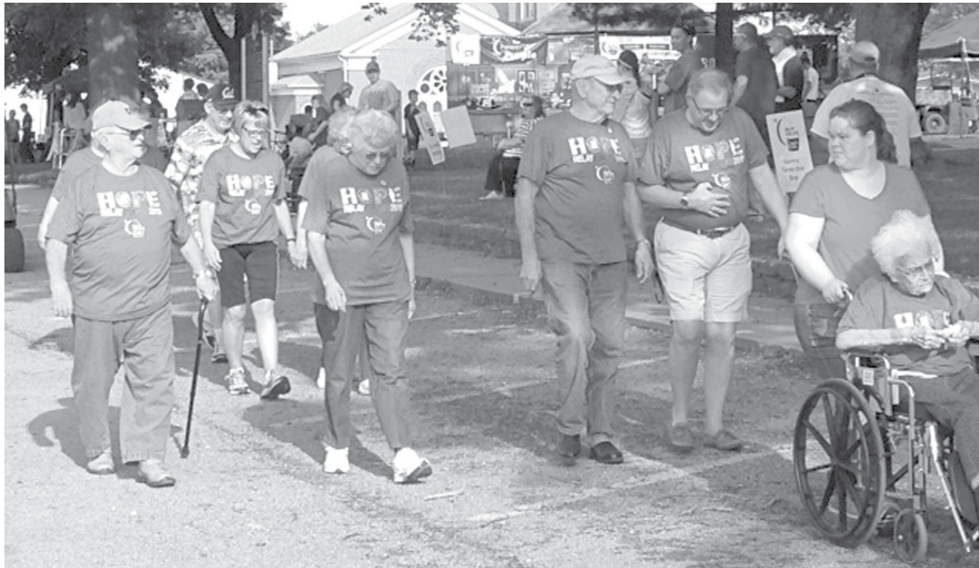
Cancer survivors walk the first lap - Of the Holt County Relay For Life on Saturday, June 6, in Oregon, MO. Fifteen survivors registered for the walk and were joined by the remaining walkers taking laps all evening, from 5 p.m. to midnight.