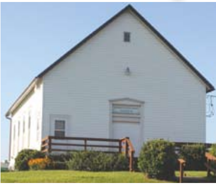
North of Mound City on Holt 140