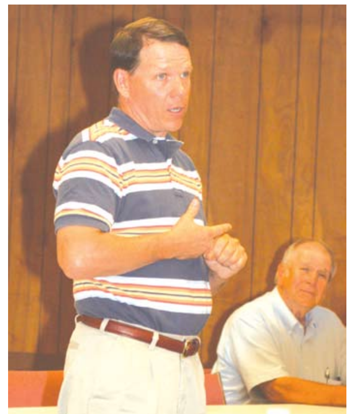
U.S. Congressman Sam Graves - Of Tarkio, MO, spoke to a large group of Holt County citizens at the T.J. Hall Building in Oregon, MO, on Wednesday, August 31. He addressed his commitment to helping those who have been fighting the flood travesty in every way possible.

Causing more distress was a brochure that was readily available at the meeting, showing, in graph format, the U.S. Army Corps of Engineers' budget comparison for the years 2002 and 2012. The graph shows a 2002 budget for environmental use at $11,000,000, and the 2012 budget at $72,888,000, a gross rise of 562.6% over the last 10 years. The flood control piece of management was budgeted at $10,980,000 in 2002, but the amount has plummeted to $137,000 in 2012. The drop is a 98.8% decline over the last 10 years.